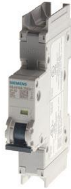
Miniature circuit breaker 240 V 14kA, 1-pole, C, 8A, D=70 mm according to UL 489